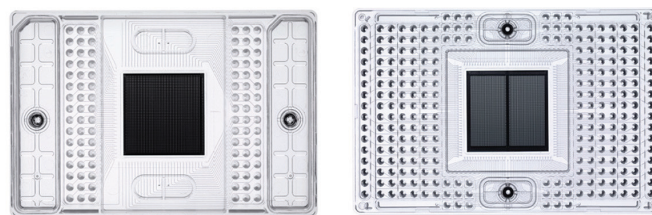
Figure 2. Integrated fluidic circuit (IFC). The LP 48.48 IFC (left) accommodates up to 48 samples per run and generates libraries containing up to 4,800 assays per sample. The LP 192.24 IFC (right) accommodates up to 192 samples per run and generates libraries containing up to 2,400 assays per sample.

The Advanta CFTR NGS Library Prep Assay is optimized to run on the Juno system, which utilizes IFCs to precisely combine multiple reactions at nanoliter volumes. Enabling scalability of both sample throughput and content, the Juno automated library preparation workflow delivers cost-effective performance you can trust with limited hands-on time.