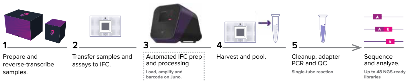
Figure 1. Workflow for the Advanta RNA Fusions NGS Library Prep Assay. Using the LP 8.8.6 IFC and the Juno system, you can configure the run to meet your operating requirements as they change. Choose to process all samples (up to 48) with one panel of assays, such as the Advanta RNA Fusions NGS Library Prep Assay. Alternatively, you can organize the 48 samples into 6 sets of 8 and simultaneously process each sample set using a different assay panel—all within the same IFC run.